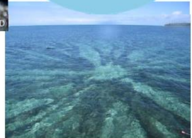
Kingdom of Tonga is an island of paradise floating in the South Pacific that can boast to the world as the color of the sea of cobalt blue .